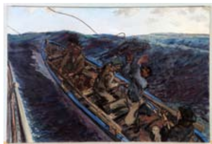
Jack B. Yeats (1871-1957) Off the Donegal Coast 1922, Gibson Bequest Fund from the artist, 1924. Crawford Art Gallery