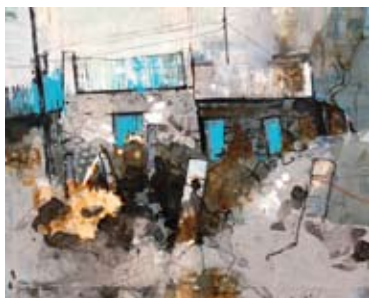
Pete Monaghan , An Tuairín , mixed media on canvas, 40 x 50 cm. Doorway Gallery, Dublin