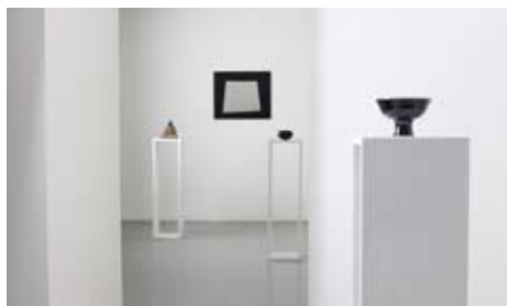
nagOffsite at Rathfarnham Castle Arts, Rathfarnham

where the space and objects become the exhibition.