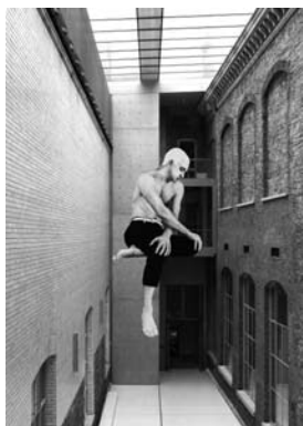
Joe Caslin , Finding Power , drawing on vinyl, 11 x 5 m. National Gallery of Ireland, 2018. Crowded Thresholds exhibition at the National Design and Craft Gallery, Kilkenny

Castle Yard, Kilkenny. T: 056 779 6147; events@ndcg.ie; www.ndcg.ie; Facebook: NDCGallery; Twitter: @NDCGallery; Instagram: @ndcgallery. Tues-Sat: 10am-5.30pm; Sun: 11am-5.30pm; Mon: Closed (except bank hol). Free adm. From Aug 10 Crowded Thresholds Presented with Kilkenny Arts Festival. Works from applied art, design, and visual art that make the invisible visible through an interest in traditional processes and materials while exploring the "emotional geography" of the subconscious in the creative process through a psychoanalytic lens. Coincides with the 100th anniversary of Freud's essay The Uncanny .