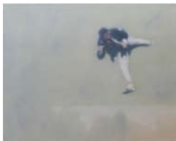
Ian Wieczorek , Crossing , 25 x 30 cm, oil on canvas.

5-25 Blurred Visions Ian Wieczorek . Based on the found "digital static" of low-resolution images from the internet, these paintings focus on the digital vernacular and its increasing influence on social and cultural identity. Out of context in a traditional visual medium, the images transcend their documentary intentions and become more malleable and subjective.