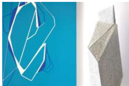
Work from the Structures and Forms, Chaos and the Void . The Empty Vessel exhibition. Farmleigh Gallery, Castletknock

abstract painting by Kohei Nakata, showing the action of lines in pearl acrylic that weave between each other in a ritualistic and repetitive process. In contrast, the paintings by Gareth Jenkins depict hard-edged lines and colour, referencing structure and form. The ceramic pieces, selected from the International Academy of Ceramics 2014 event in Dublin Castle, exhibit structures and forms categorised by organic, chaotic, and vessels, which also demonstrate the Japanese concept of Shibui – reduction, quietness, humility, and the philosophy of the Japanese aesthetic in the chawan (tea bowls) of Masashi Suzuki. Curated by Mark St. John Ellis.