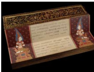
Manuscript from Thai Buddhist Tales at the Chester Beatty, Dublin

Dublin Castle, Dublin 2. D02 AD92. T: 353 | 4070750; fax: 353 | 4070760; info@cbl.ie; www.chesterbeatty.ie; Twitter: @CBL_Dublin. Mon-Fri: 10am-5pm; Sat: 11am-5pm; Sun: 1pm-5pm. Closed: Mon from Nov-Feb, Jan 1, Good Friday, Dec 24-26, and Mon public hol. Adm free; Suggested donation: €5. Ongoing: Thai Buddhist Tales: Stories along the Path to Enlightenment The Chester Beatty preserves an internationally important collection of Buddhist manuscripts from Thailand. A selection of these books in this exhibition provides a rare opportunity to explore the Buddhist tales depicted. Supported by the Robert H.N. Ho Family Foundation. Adm. free. Ongoing: The Mystery of Mani In 1929, seven papyrus books from the lost Manichaean religion were discovered in Egypt. Dated to c. 400 AD, these unique texts proved critical in deepening understanding of this once thriving, yet effectively suppressed, faith.